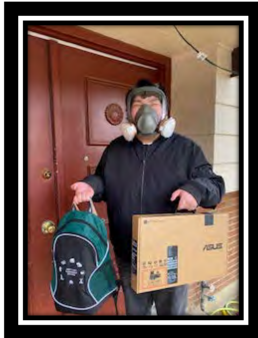
MIYWASIN YOUTH BACKPACK KIT PROGRAM