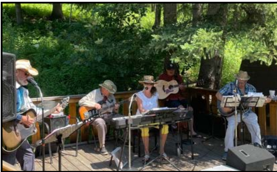
Silver Saddle Gang playing at the July Summer BBQ at Camp Miywasin.